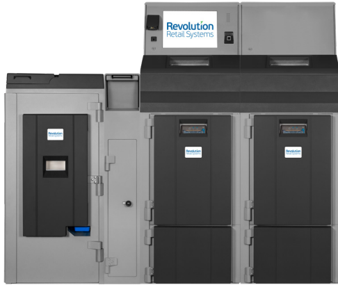
Fortis 4SE Dual with Drop Vault