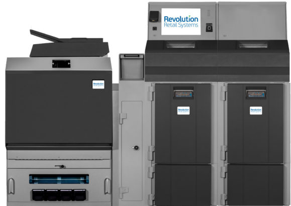
Fortis 43LW Dual with Drop Vault