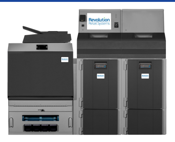
Fortis 4LW Dual