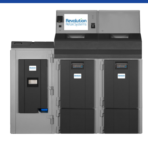
Fortis 4SE Dual